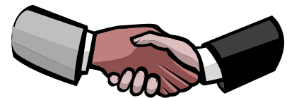
Reach out to a Friend

Sunday Evenings in April will include "Embracing the Vision II" a second edition of a video series from the Foreign Mission Department. These videos follow some experiences of others who have gone on mission trips and used their gifts and resources to make a difference. What can you do? Come and